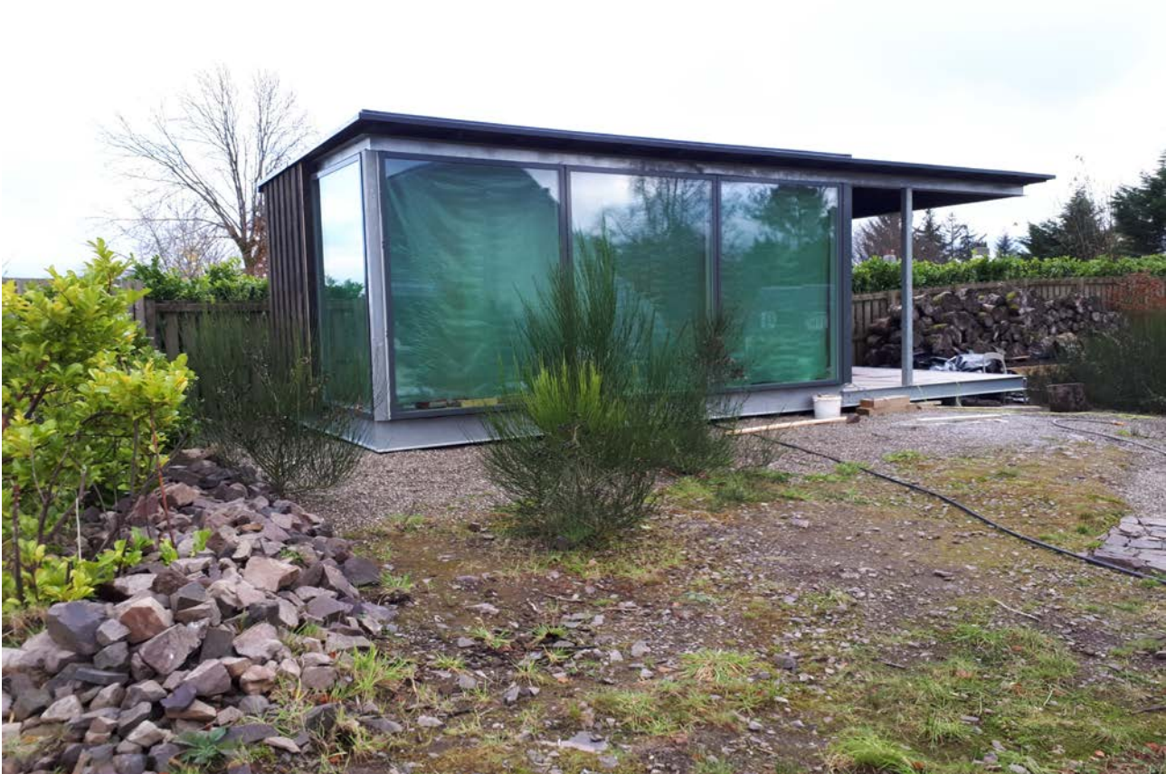
Close view from raised garden area within the applicant's plot

The material considerations in determination of this application are the Inverclyde Local Development Plan (LDP), the Planning Policy Statement (PPS) on Our Homes and Communities, the representations, the amenity impact of the building and its relationship to the application site and neighbouring properties.