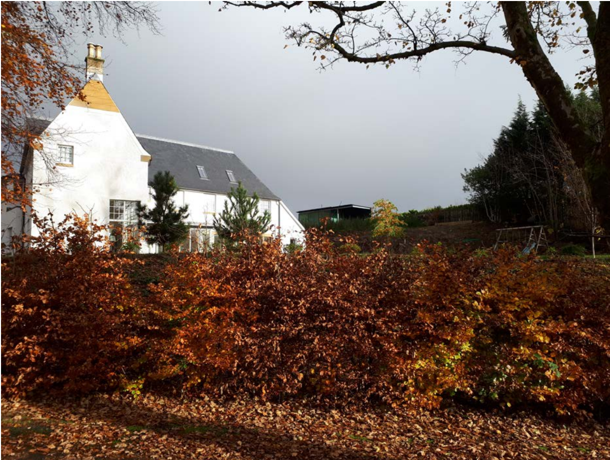
Western view from Knockbuckle Lane

Having assessed the position of the building from the public domain I am satisfied that, although visible from specific positions on Knockbuckle Lane, it could not be argued to dominate the streetscene nor have an overbearing presence in this regard. I therefore conclude that the building has an acceptable impact on the streetscene and the residences which view the building from these locations or beyond them. There will be a more immediate impact on those dwellings immediately adjacent to the site. As only one of these is presently occupied I will first consider the dwelling to the south-east known as “The Stables”.