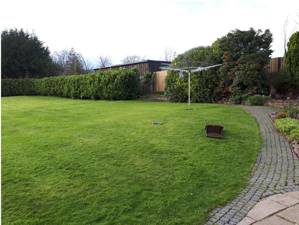
View from approximately the centre rear of "The Stables" immediately adjacent to the house

intervening vegetation) I do not consider the building to have any impact on the daylight received by the rooms in "The Stables". Furthermore, being located to the west to north-west of the affected windows on the house I do not consider that any loss of sunlight to these rooms will be of any significance with any possible minimal effect restricted to approximately the last couple of hours of sunlight in the middle of summer. I am also satisfied that given the size of the garden and the combination of the screen fencing and the laurel bushes the additional impact of the building on daylight and sunlight received by the wider garden area is negligible.