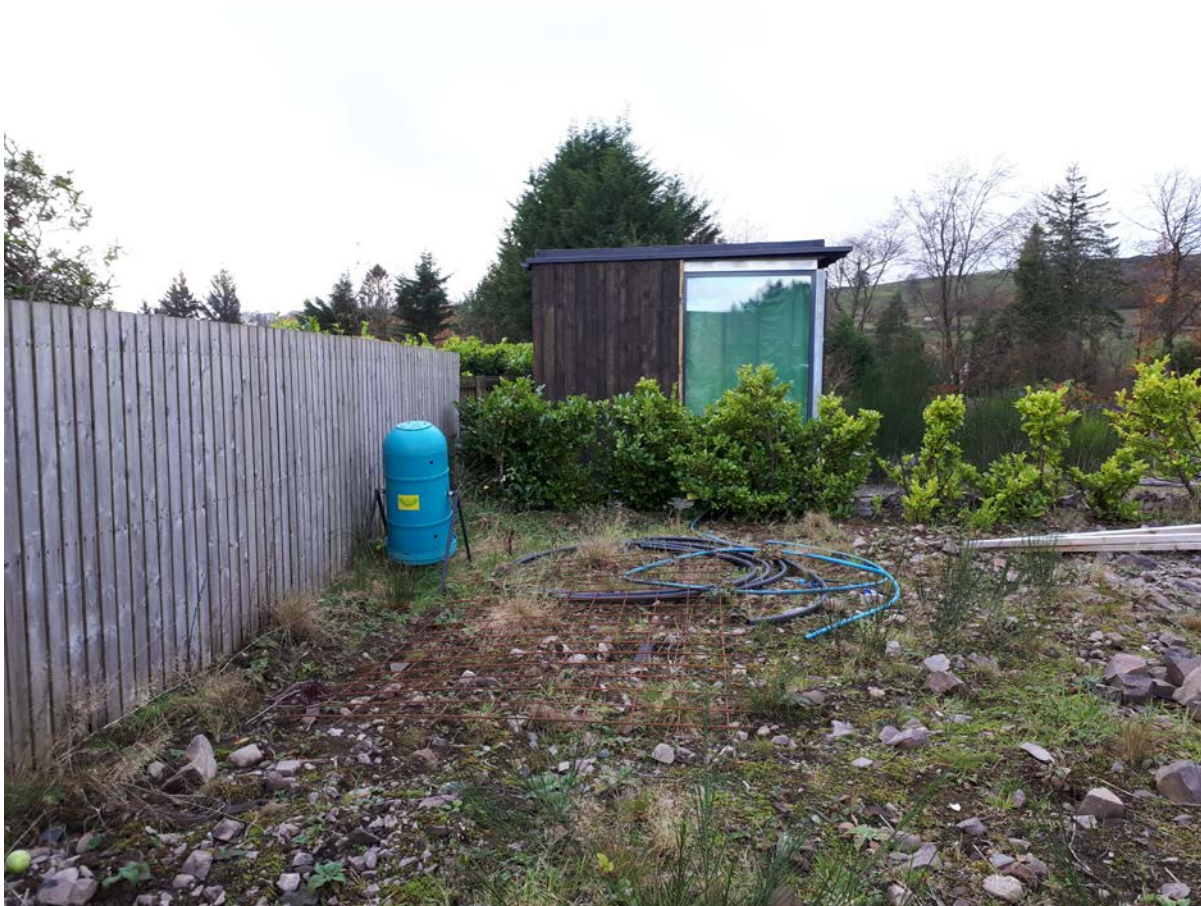
View from plot under development to the north-east

At approximately 33 square metres, 21 square metres of which is a room with the remaining 12 square metres an external covered terrace, it is a large outbuilding but this requires to be viewed in the context of the scale of both the associated dwellinghouse and the plot within which it stands. Both the associated dwellinghouse and plot curtilage are of large scale with the house approximately 10.5 metres in height and covering approximately 204 square metres and the plot extending to approximately 2,580 square metres. In this context, I consider that the outbuilding does not create any impression of overdevelopment and is of acceptable size relative to the plot.